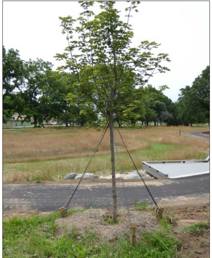
Tree guyed with three points of attachment, less than 2/3 the height of the tree.

Guying is temporary and typically used on larger trees that are transplanted balled-and-burlapped. Three points of attachment provide the best support for these large-tree installations. Often this is done by attaching a wire to an anchor and slipping it through hose material around the tree. However, the hose material and wire can cause damage from abrasion at the attachment point. It is best practice to use wide, smooth, flexible tie-materials such as soft webbing weave, that can help dissipate pressure exerted on the tree where it attaches. This minimizes abrasion and damage to the cambial tissue just beneath the bark on the trunk and stems.