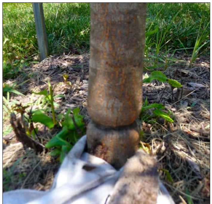
Tree wraps can girdle the trunk, causing damage and even death.