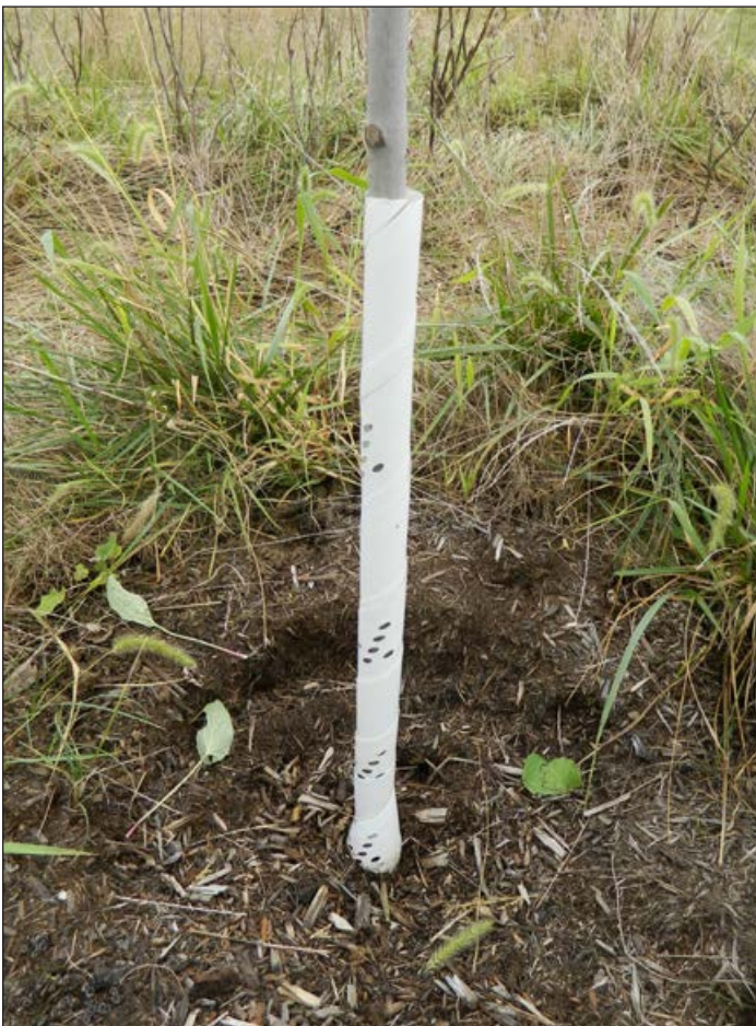
Flexible wraps expand as the tree grows, which prevents the chance of girdling the trunk.

Tree support systems such as staking and guying should only be considered when conditions and exposure to the wind make it necessary to keep a tree upright. When staking and guying is deemed essential, install all supports properly to prevent damage to the tree and remove them as soon as possible—usually after one growing season. Review the system regularly and adjust it as needed to ensure the equipment is functioning properly.