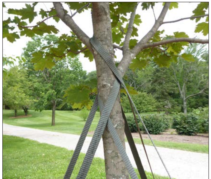
This newly transplanted tree is guyed with flexible webbing materials.