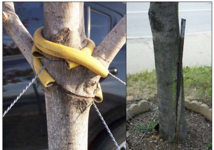
Support wires left too long can girdle the tree, either killing the tree or making it more likely to break off. Stakes left in the ground create a hazard and damage tree structure.