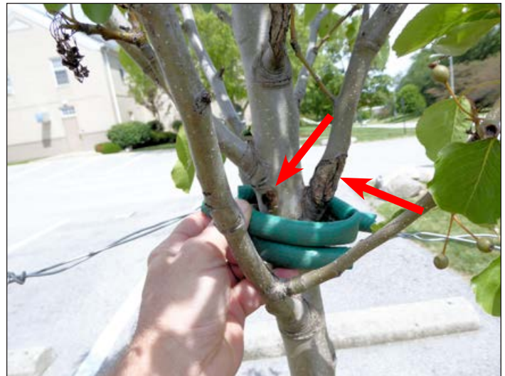
Cambial tissue can be damaged by improperly installed support materials. Note the wounds where the hose was resting.

There can be distinct disadvantages. Improperly staked trees suffer from poor development such as decreased trunk diameters and smaller root systems—and may be unable to stay upright after you take the supports away. Often trunk tissue suffers from rubbing and may even be girdled by support materials. Also, due to poor development and taper, previously supported trunks are more likely to break off in high winds or blow over after stakes are removed.