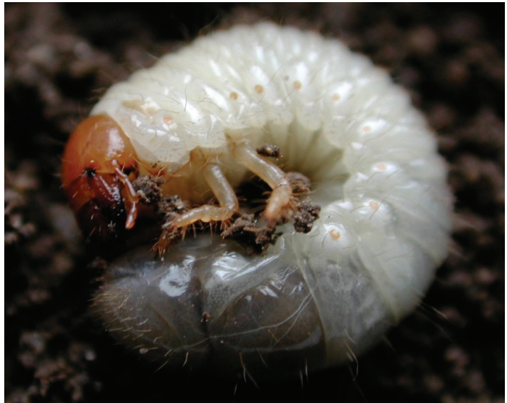
Figure 2. Japanese beetle larvae (grubs) are soft bodied, light colored-C-shaped, soil-dwelling insects with a light brown head.

Adult beetles are most active from mid-June through August (Fig. 3 and 4) and can feed on more than 400 different species of plants. They are especially fond of roses, grapes, smartweed, soybeans, corn silks, flowers of all kinds, flowering crabapple, plum and linden trees, as well as, overripe and decaying fruit. Adults can fly considerable distances (1-2 miles) to feed on leafy plants or to lay eggs. In areas of heavy infestation, the adults will attack and injure foliage and flowers.