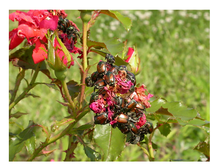
Figure 3. Japanese beetles feeding on rose flowers.

containing Azadirachtin can be effective repellants that can reduce defoliation when applied regularly (but no more than weekly) during beetle flight. Apply before defoliation becomes intolerable. In years when beetle populations are very high, noticeable defoliation may occur because adults will consume a small amount of insecticide tainted leaves before they are killed. Soil applications of insecticides on flowering trees should be delayed until after petals have fallen. Concentrate control efforts on trees that are susceptible to beetles (Table 2). When possible, replant with species that are resistant to adult feeding (Table 3). Consult Table 4 to find crabapple varieties resistant to Japanese beetle.