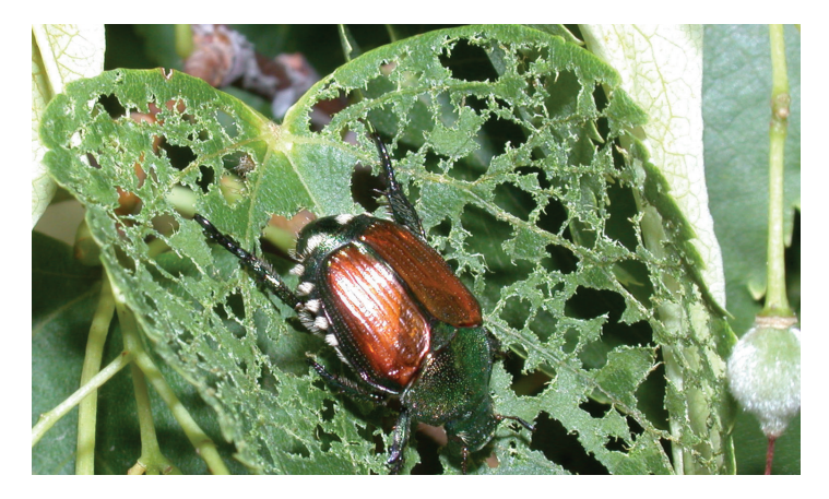
Figure 1. Adult Japanese beetles are 1/2 inch long, metallic green and bronze in color, with a row of white hairy tufts along each side of the body.

Adult Japanese beetles are about 1/2 inch long, metallic green and bronze in color, with a row of white hairy tufts along each side of the body (Fig. 1). Immature forms of this pest are light colored-C-shaped grubs with a light brown head (Fig. 2) and can be found in the soil from mid-July through the following June.